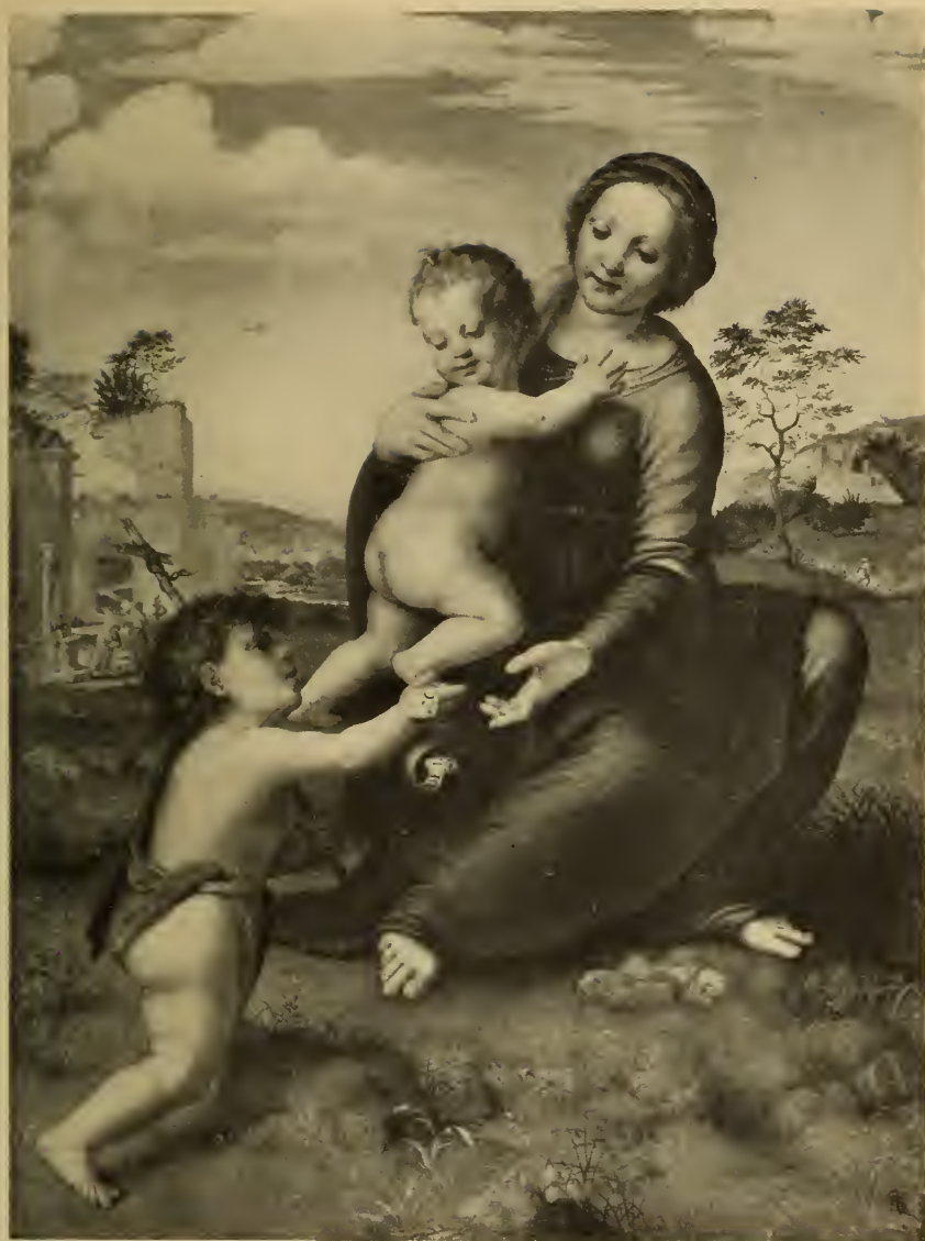
THE MADONNA DEL POZZO (OF THE WELL)

FROM THE PAINTING BY FRANCIABIGIO IN THE UFFIZI